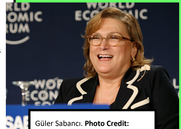
Güler Sabancı.