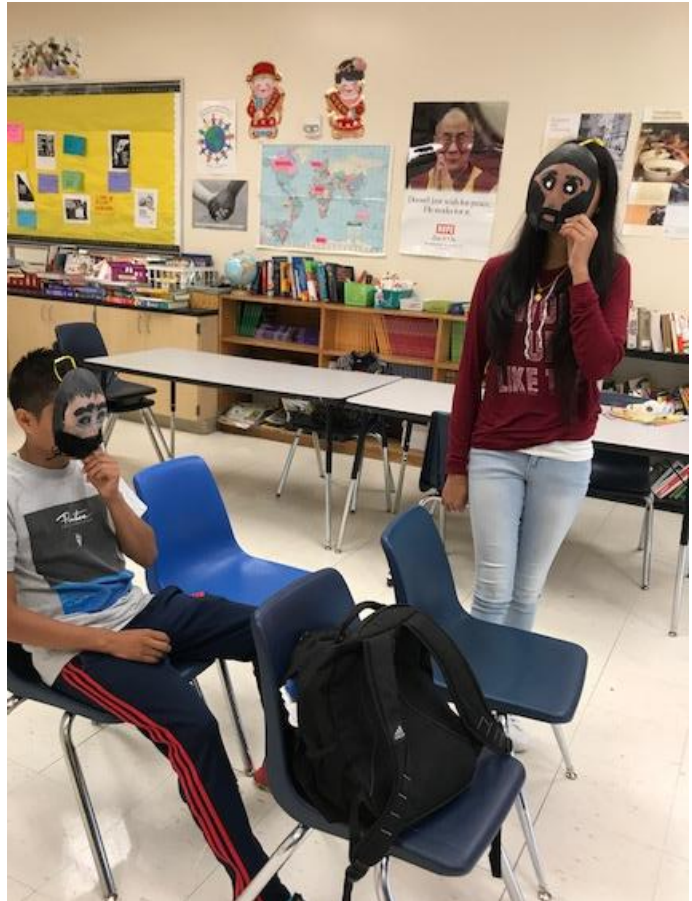
Figure 2- scene from a play about harassment