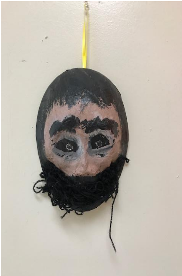
Figure 1- a mask of an old man for a social justice play